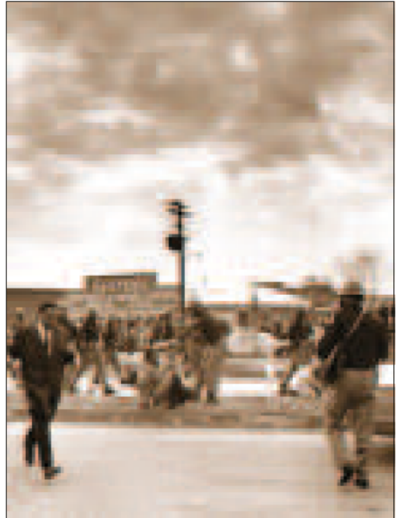
In this March 7, 1965 file photo, John Lewis (center) of the Student Nonviolent Coordinating Committee is forced to the ground by a state police officer as troopers break up the demonstration on what has become known as “Bloody Sunday” in Selma, Ala. Supporters of black voting rights organized a march from Selma to Montgomery to protest the killing of a demonstrator by a state trooper and to improve voter registration for blacks, who are discouraged to register.

“We broke down those signs that said, ‘White Waiting,’ ‘Colored Waiting,’ ‘White Men,’ ‘Colored Men,’ ‘White Women,’ ‘Colored Women.’ We got a Voting