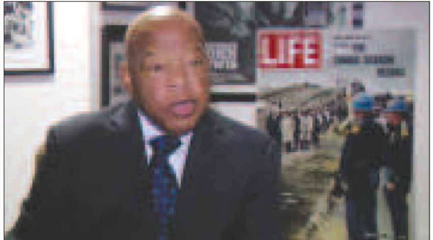
U.S. Rep. John Lewis, D-Ga., discusses the historical drama “Selma” and civil rights in the United States during a recent interview. Forty-nine years after Lewis and other marchers tried to cross the Edmund Pettus Bridge in Selma, Ala., memories of “Bloody Sunday” are still vivid in his mind.

The march is credited with helping build momentum for passage