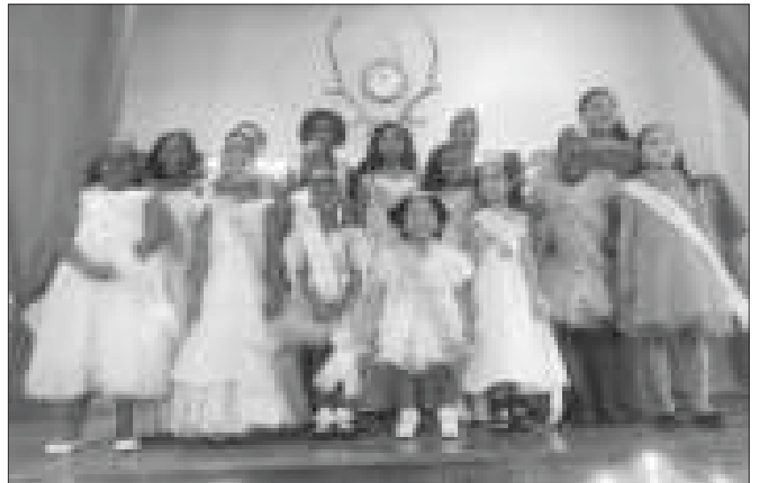
Members of the Portland Princess organization participate in their coronation ceremony.