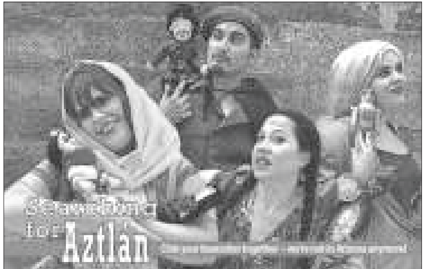
Searching for Aztlan, a play rooted in the 50 year-old movement for dignity and labor rights for Latino immigrants.

Yo dawg is gonna look like a show dawg and your kitty will be pretty.