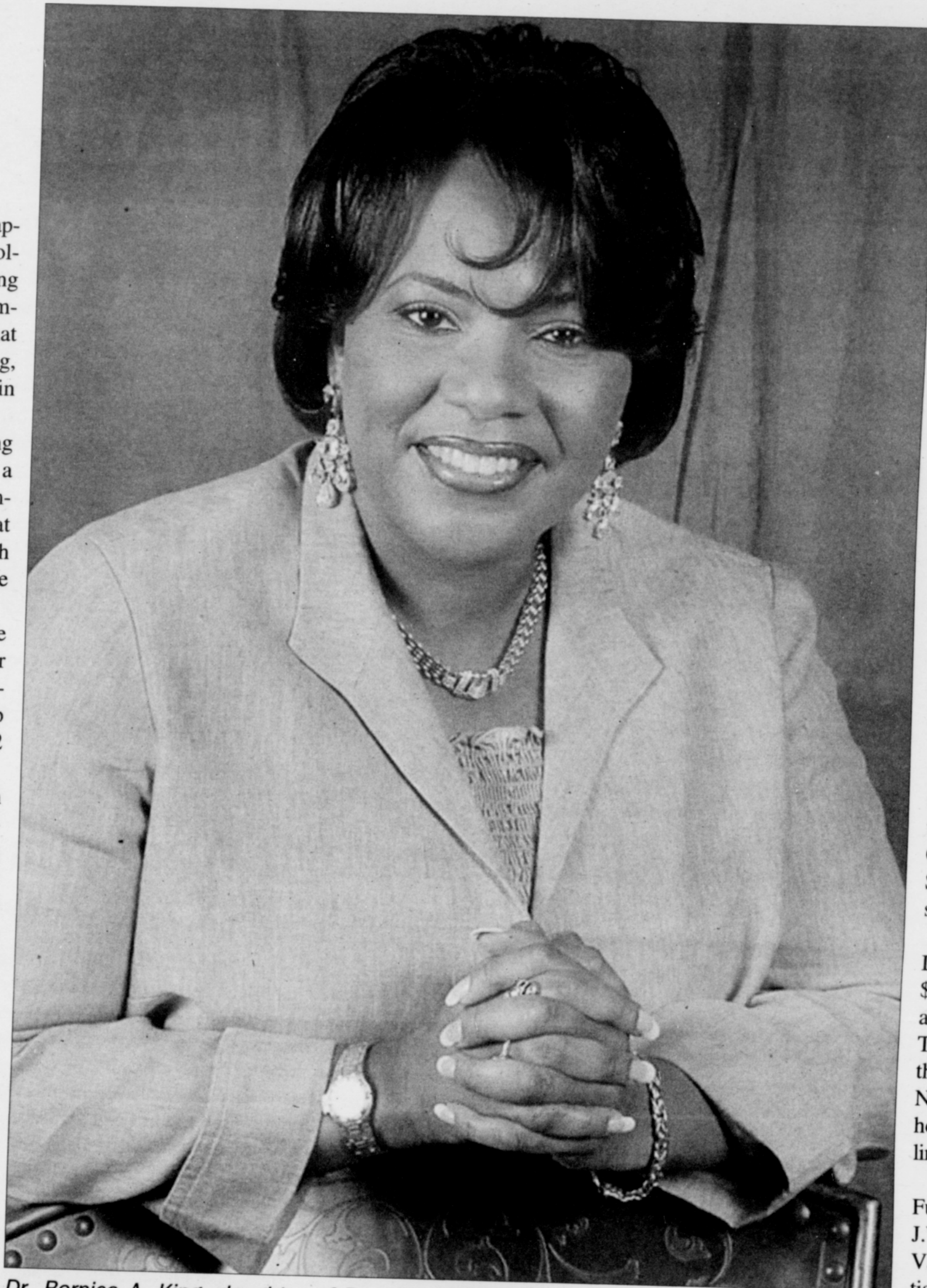
Dr. Bernice A. King, daughter of Rev. Dr. Martin Luther King Jr., will be the keynote speaker when the Vancouver Avenue First Baptist Church hosts its annual Drum Major Ecumenical Community Scholarship Service on Sunday, Feb. 15.

Nationally and internationally known as one of the most powerful, motivating and life-chang-