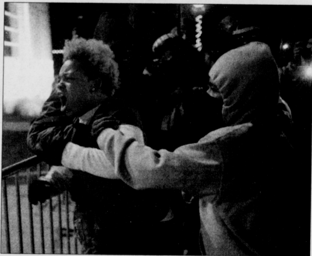
A woman approaches a barricade Monday to confront the police outside the Ferguson Police Department in Ferguson, Missouri.

Choose the announcement size that best suits your requirements: 1 unit (above center) is perfect for a photo and short statement, great for birthdays and graduations or any occasion stated briefly. 2 units (right) allows for a larger photo and more details on your occasion. 4 units (left) is ideal for occasions that have a lot of content and includes larger space for photos, artwork and the declaration's title. Talk to your announcement representative today at The Portland Observer by calling 503.288.0033 or email ads@portlandobserver.com