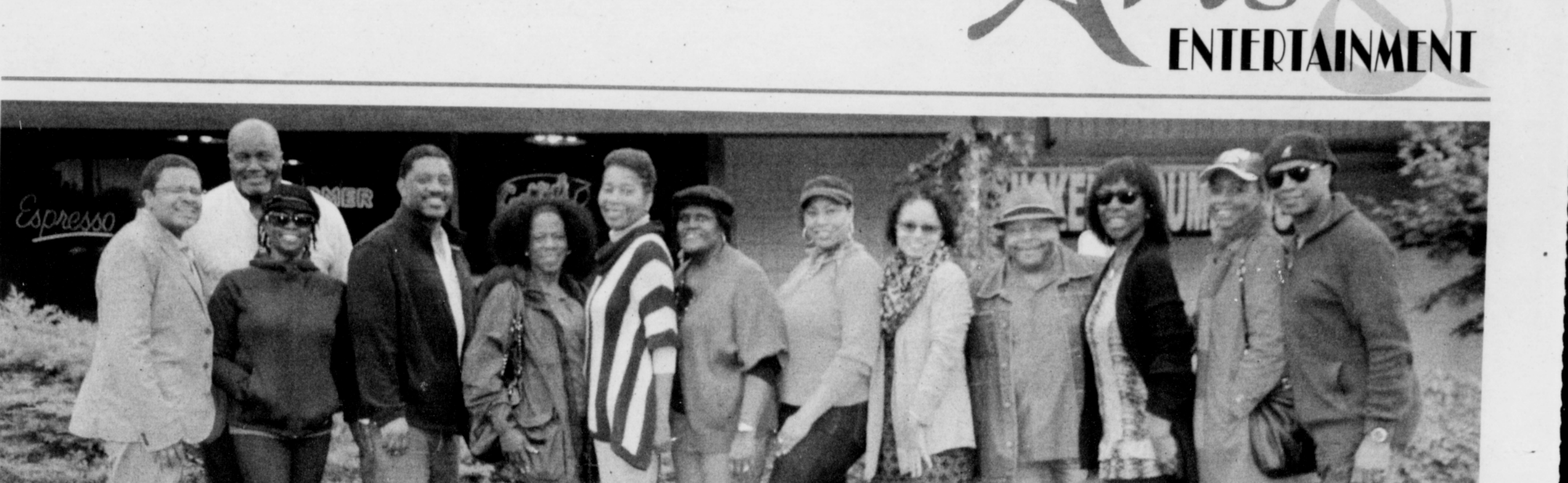
Participants in the Groovin High Steppers, a non-profit almed at connecting diverse urban communities through dancing, sponsor a fundraiser this weekend with games, music and food at the Colwood Golf Center, 7313 N.E. Columbia Blvd.