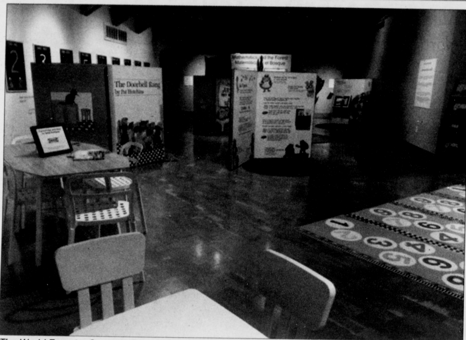
The World Forestry Center's Discovery Museum presents 'Go Figure!' a kid-sized world where children and adults can have fun exploring math with larger-than-life books and math-related activities. The exhibit runs through Feb. 1