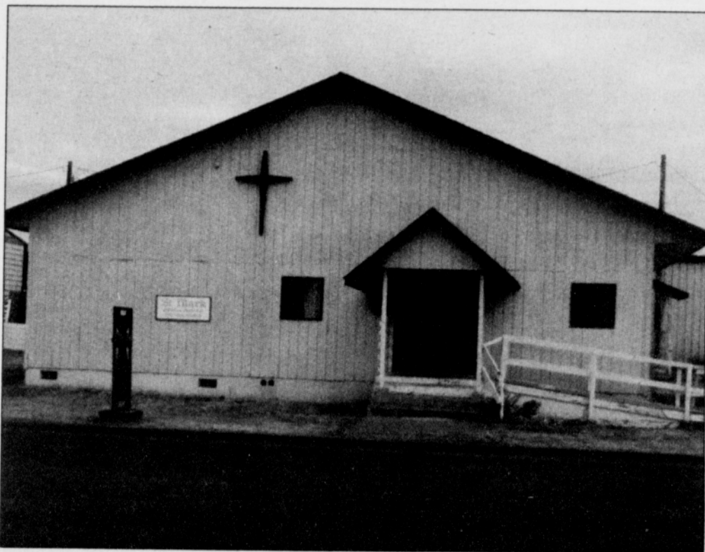
The St. Mark CME Church has been identified as having historic significance for African Americans in Oregon.

been extended to Dec. 31. You may submit your information online at makeoregonhistory.com or at oregonblackpioneers.org . Provide as much information as you can, but it is okay to leave blanks if you do not know the particular information requested. Go to www.makeoregonhistory.com to submit online.