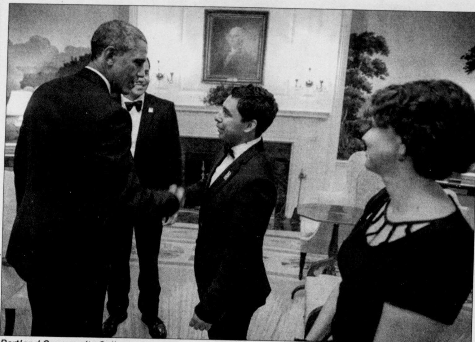
Portland Community College alum Victor Mena meets President Barack Obama during a White House visit to lobby for immigration reforms.