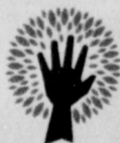
Exhibit now open

Discovery Museum - World Forestry Center worldforestry.org