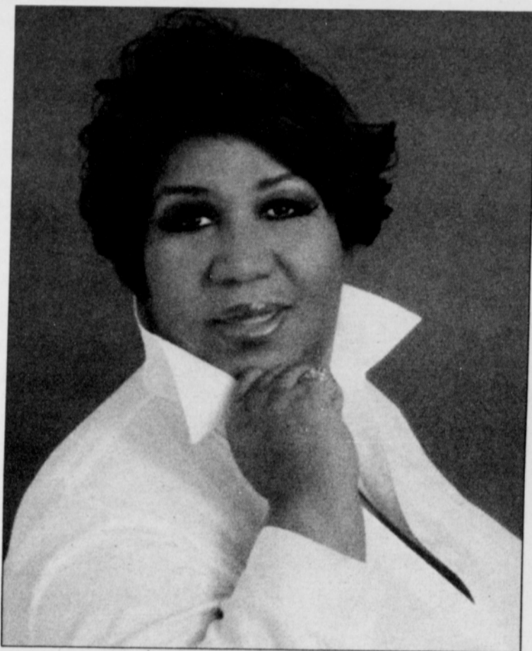
Aretha Franklin covers classic songs.