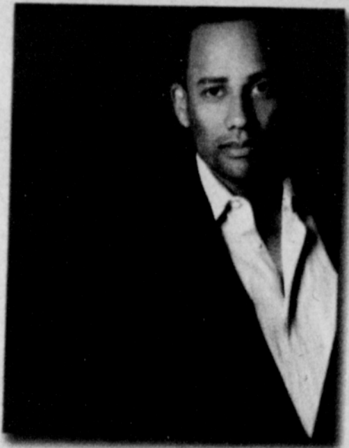
HILL HARPER An Evening with Hill Harper Saturday, October 18