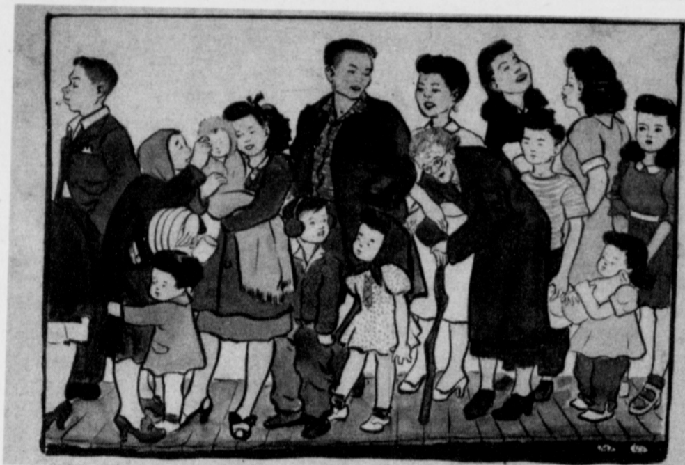
Titled 'Chow Line,' this illustration by Masao Mike Kawaguchi depicts the artist's family waiting in line for the mess hall while they were incarcerated at the Minidoka concentration camp in Hunt, Idaho, in 1943.