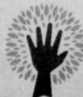
Exhibit now open

Discovery Museum - World Forestry Center worldforestry.org