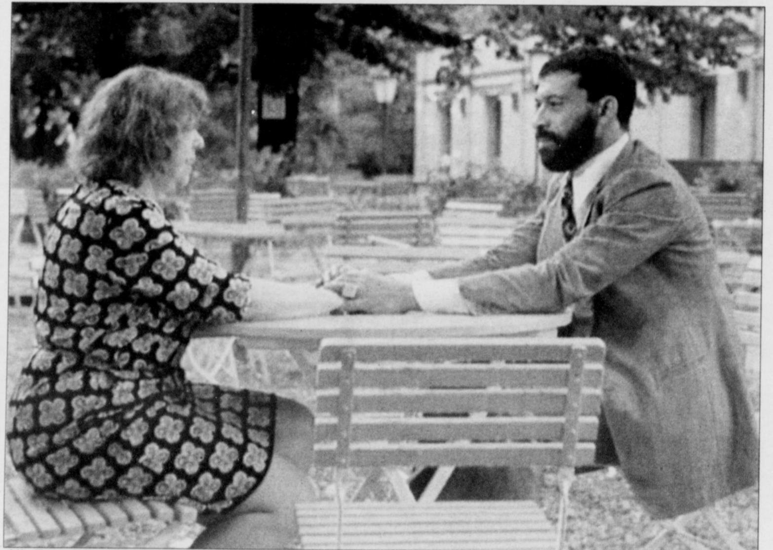
Ali: Fear Eats the Soul , a film that takes on the issues of racism and love across generations will be screened on Friday, Sept. 12 at 7 p.m.; and Sunday, Sept. 14 at 4:30 p.m.; at the Northwest Film Center's Whitsell Auditorium in the Portland Art Museum, downtown.

This project is supported in part by a grant from the Oregon Arts Commission and the National Endowment for the Arts.