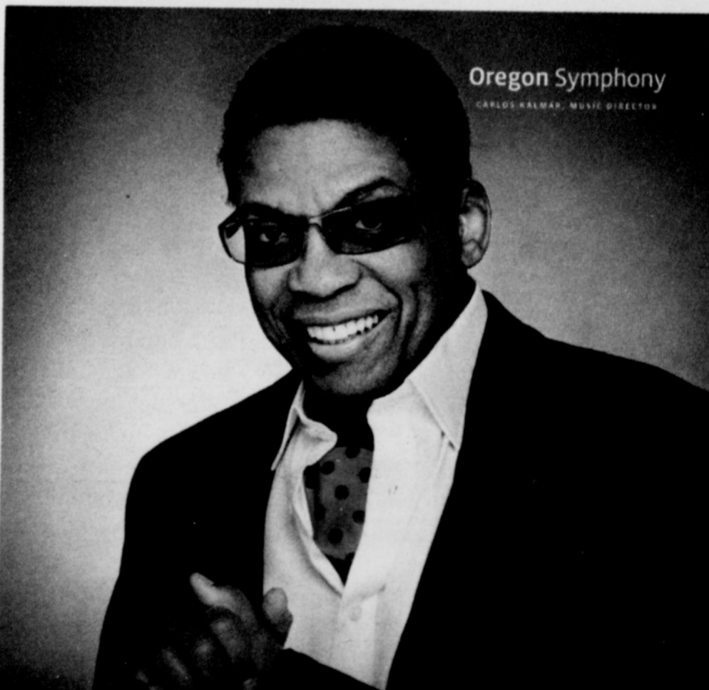
Oregon Symphony CARLOS MALVAR, MUSIC DIRECTOR

The menu includes authentic Creole-style jambalaya (a non-seafood version is available) or BBQ Ribs, along with bread, salad, beverage and dessert. Cost is $15 for adults or $45 for a family ticket for four. Tickets are available at mealsonwheelspeople.org, from the center or at the event. Meals are available for take-out.