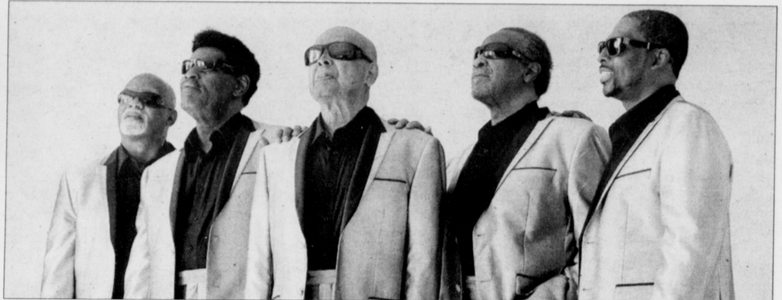
Gospel and Blues legends and 5-time Grammy winners, the Blind Boys of Alabama, are one of 8 headline acts coming to the 17th annual Vancouver Wine and Jazz Festival.