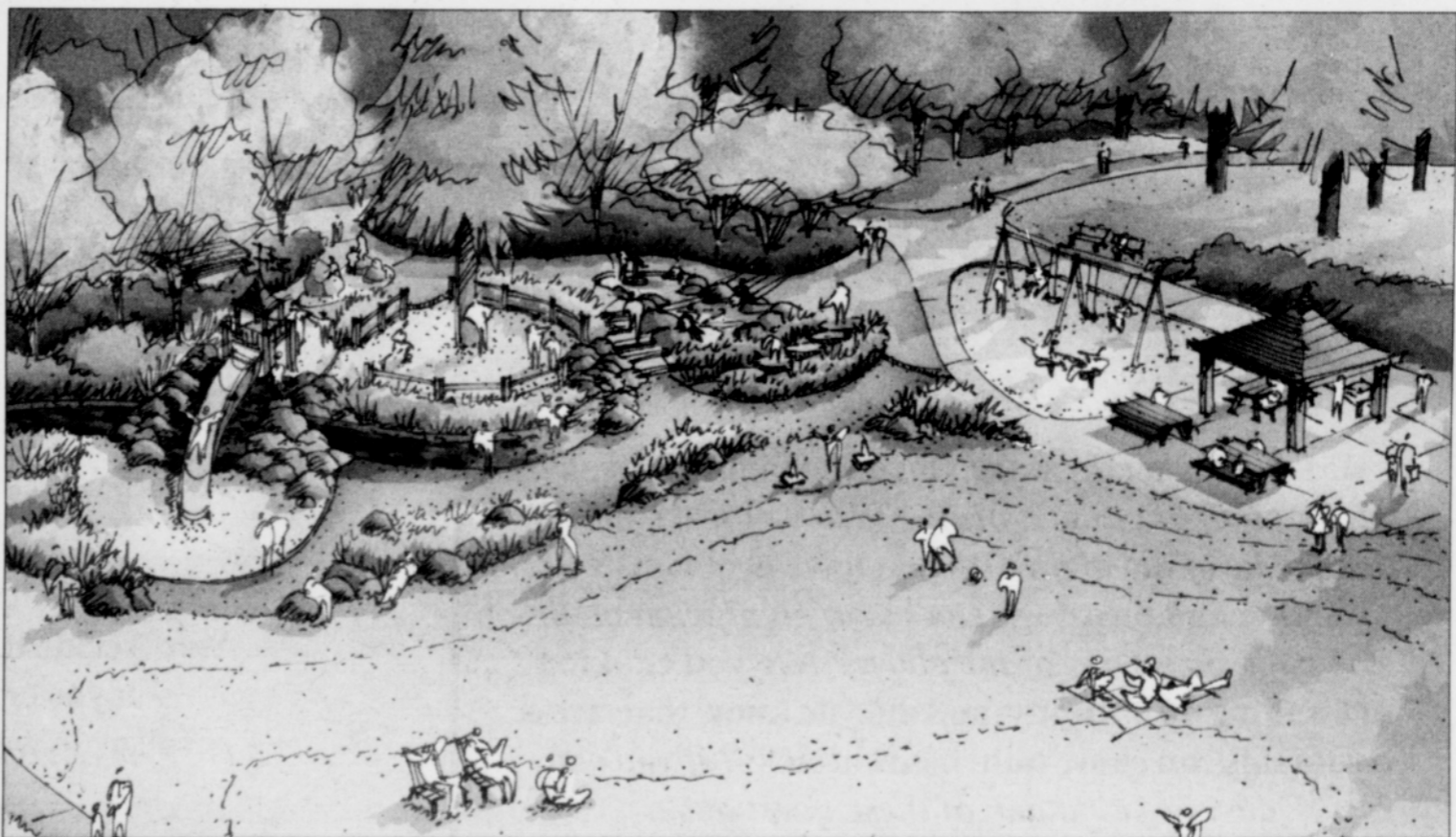
An artist's rendering shows the future 2.4 acre 'Khunamokwst Park' at Northeast 52nd Avenue and Alberta Street, the first developed park in the Cully Neighborhood.

If you want to see the work up close, enjoy some food, and celebrate Reeves and art, you're invited to an open air art opening in the parking lot of the building where the mural is located at 430 N.E. Lloyd Boulevard. It's set for Friday, Aug. 15 from 6 p.m. to 9 p.m.