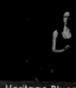
Heritage Blues Orchestra