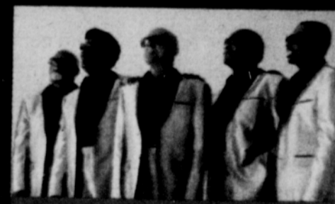
Blind Boys of Alabama

15 Bands • 200 Wines • Fine Art • GREAT Food!