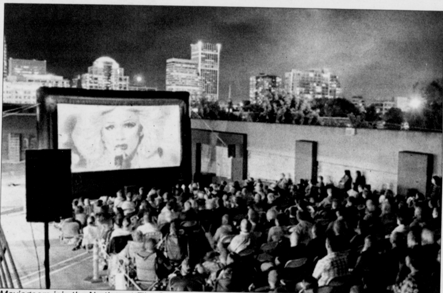
Moviegoers join the Northwest Film Center atop Hotel deLuxe's parking structure at Southwest 15th and Yamhill for the Top Down: Rooftop Cinema series.