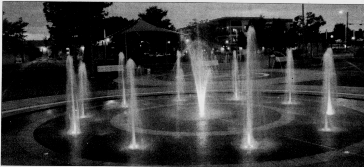
A new Children's Fountain in the Arts Plaza of downtown Gresham officially opened on July 4. The water is controlled by a computer program that makes the jets disappear - then leap to life - at random intervals for maximum fun. At night, the fountain is lit by a subtly shifting display of 20 multi-colored LED lights.