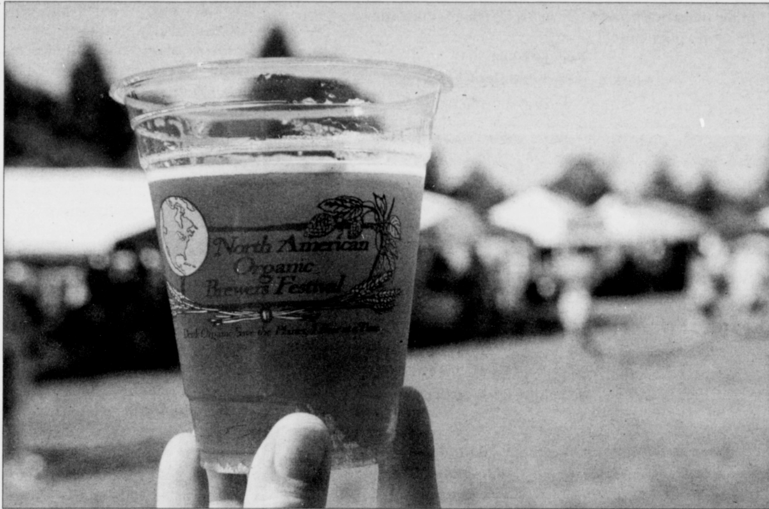
Designed to raise awareness about organic beer and sustainable living, the North American Organic Brewers Festival typically serves up more than 50 organic beers and ciders from nearly 40 different breweries.