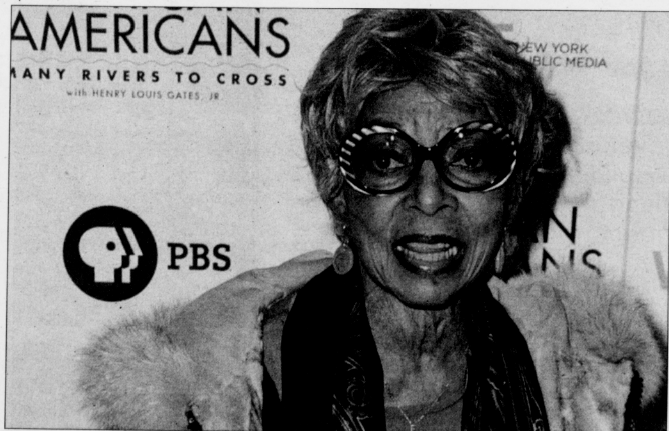
Ruby Dee's career spanned stage, radio, television and film.

Camp organizers say enrollment spots tend to fill quickly. For more information and to register for camp, visit oregonzoo.org .