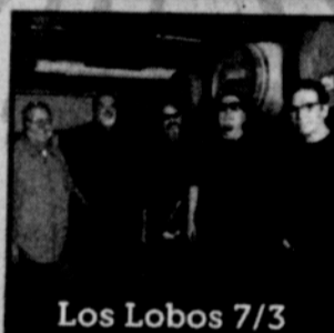
Los Lobos 7/3

Four DME Blues Cruises on Portland Spirit Red, White & Blues Run 7/6