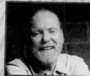
Gregg Allman 7/6