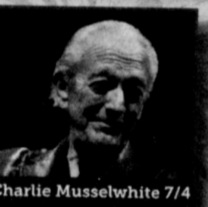
Charlie Musselwhite 7/4