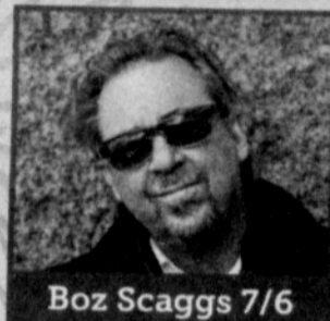
Boz Scaggs 7/6