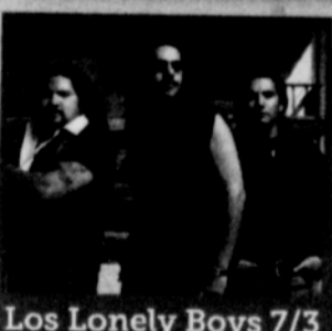
Los Lonely Boys 7/3