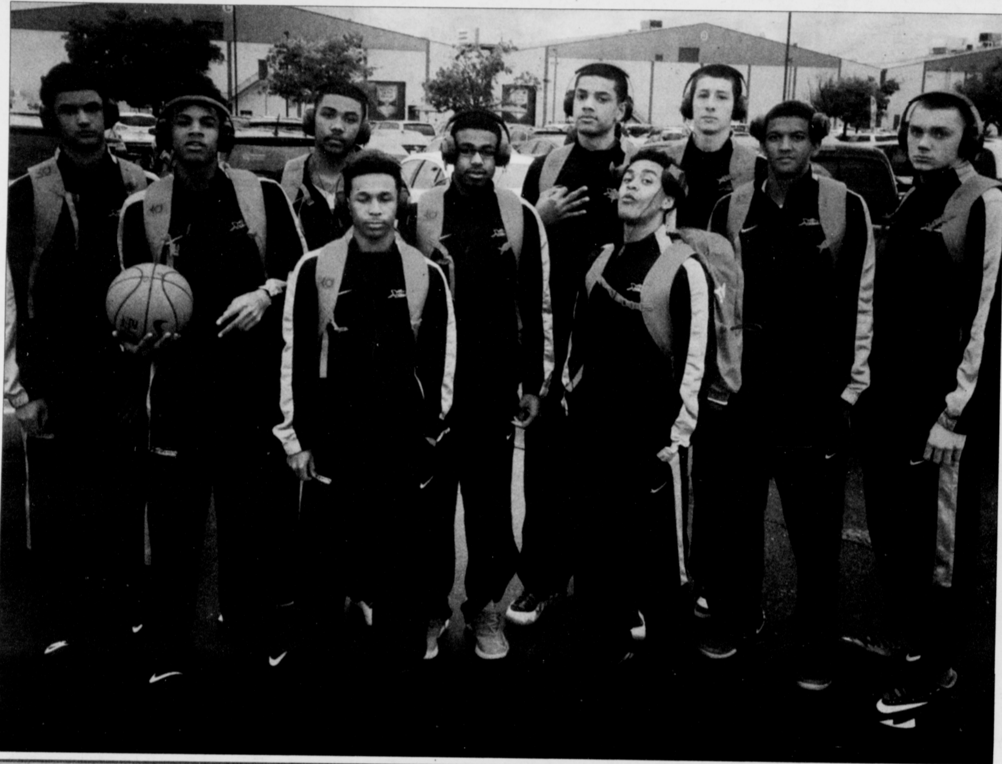
The Nike Elite team is one of this weekend's Rose City Showcase marquee lineups. The team is comprised of the best players from Oregon and Washington, including kids from Jefferson and Rainier Beach in Seattle, two schools who have won back-to-back state titles.