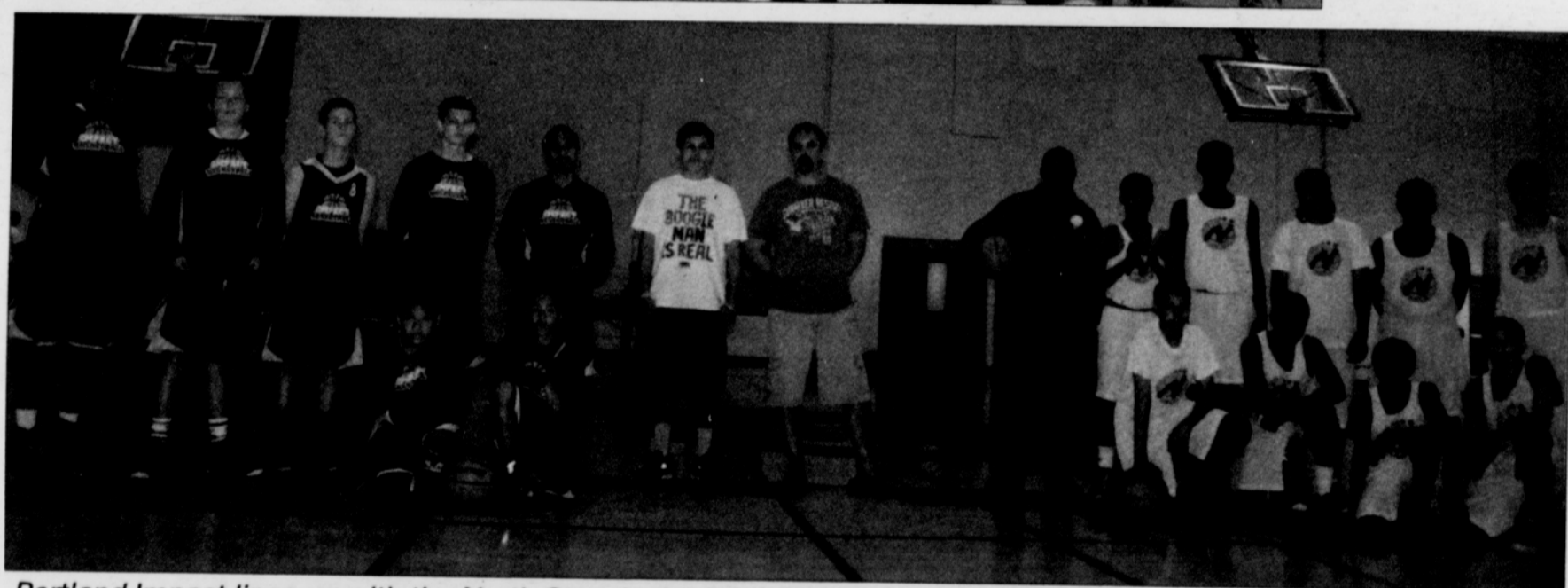
Portland Impact lines up with the North Starz in the 14th Annual Portland Observer Joyce Washington Classic.