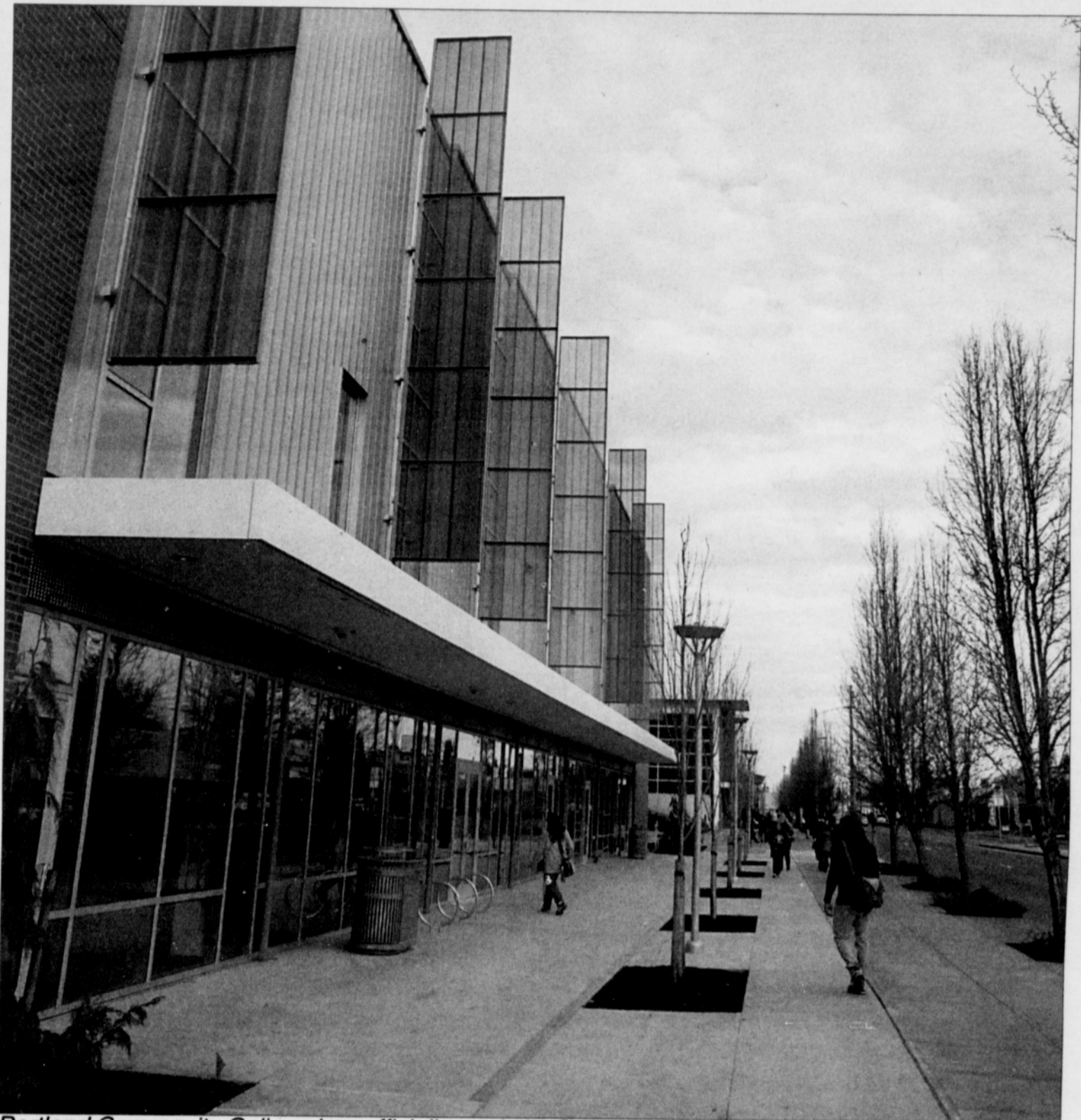
Portland Community College has officially made its Southeast Center a comprehensive campus. The educational facilities at Southeast 82nd and Division join PCC's Sylvania, Rock Creek and Cascade campuses as locations with full academic and support services.