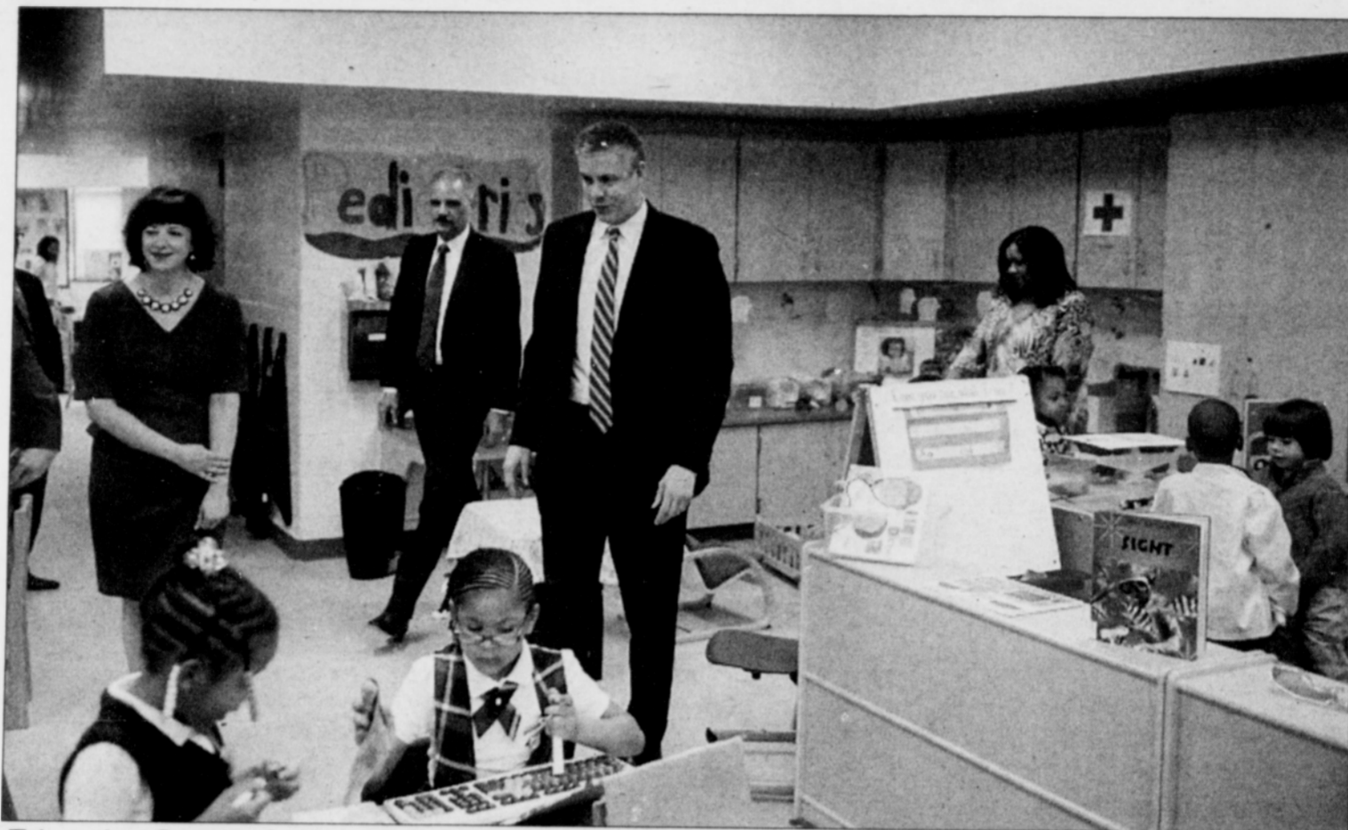
Education Secretary Arne Duncan and Attorney General Eric Holder meet with a preschool class prior to participating in a discussion earlier this year on the importance of universal access to preschool. Thursday, the officials reminded school districts they cannot deny an education based on their parent's immigration status.

"We want to be sure every school leader understands the legal requirements under the Constitution and federal laws, and it is our hope that this update will address some of the misperceptions out there," Depart-