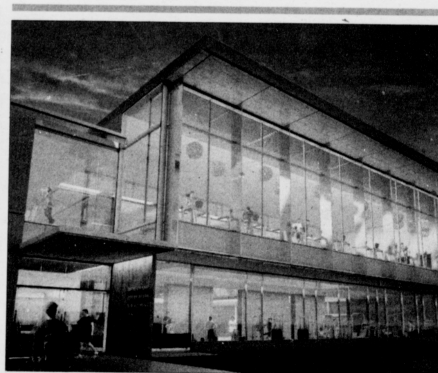
An artists' rendering shows the new Beauchamp Recreation and Wellness Center coming to the University of Portland campus in north Portland.

For more information, visit www.pcc.edu/cascade or pay us a visit at 705 North Killingsworth Street.