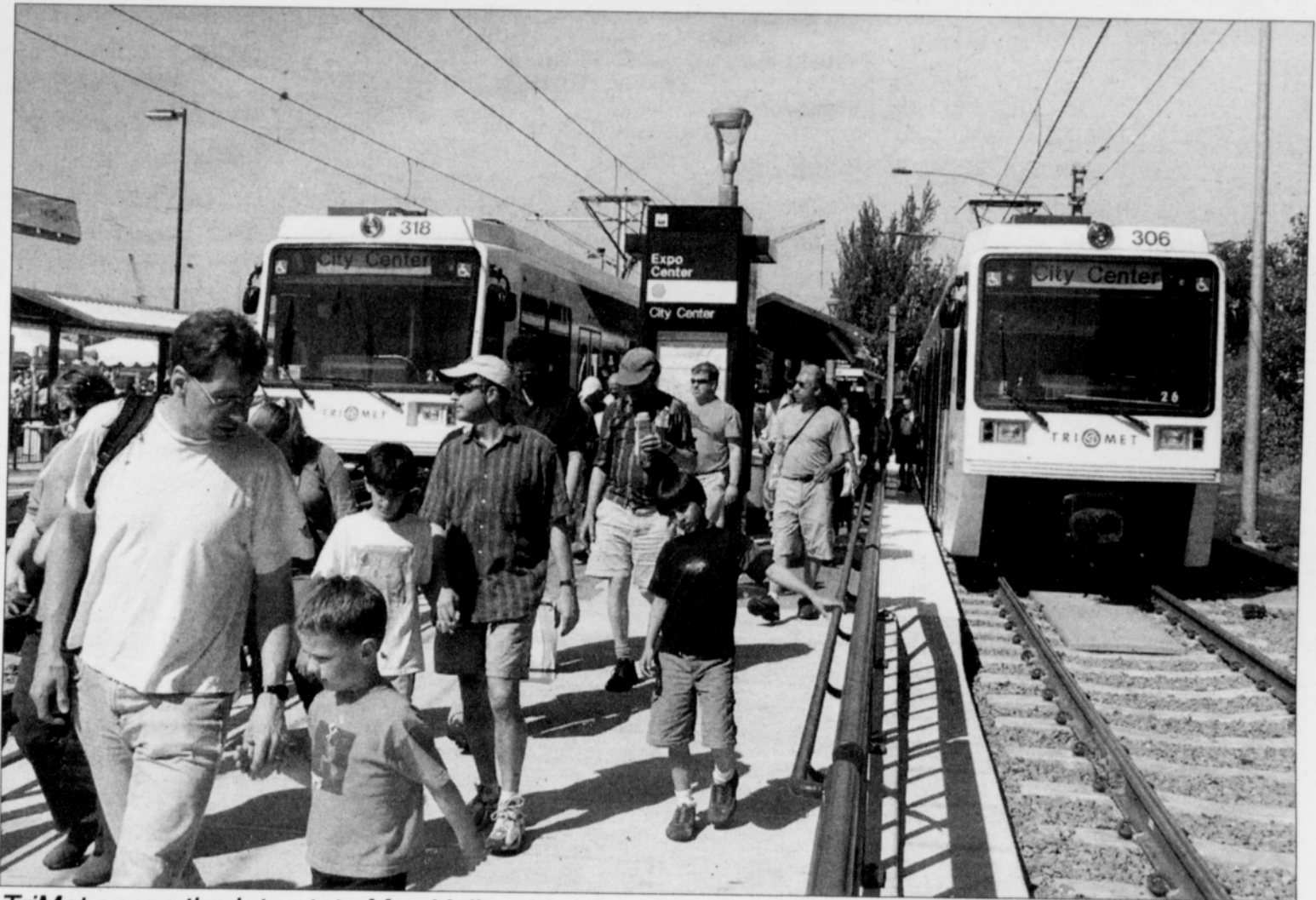
TriMet opens the Interstate Max Yellow Line from the Rose Quarter to the Expo Center on May 1, 2004, attracting thousands of riders.