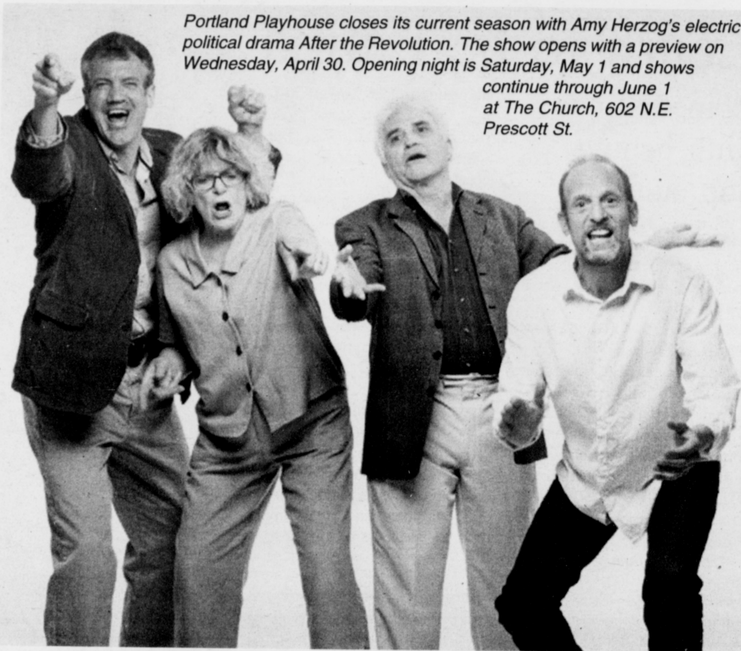
Portland Playhouse closes its current season with Amy Herzog's electric political drama After the Revolution . The show opens with a preview on Wednesday, April 30. Opening night is Saturday, May 1 and shows continue through June 1 at The Church, 602 N.E. Prescott St.

While the underlying history and political issues are richly interwoven