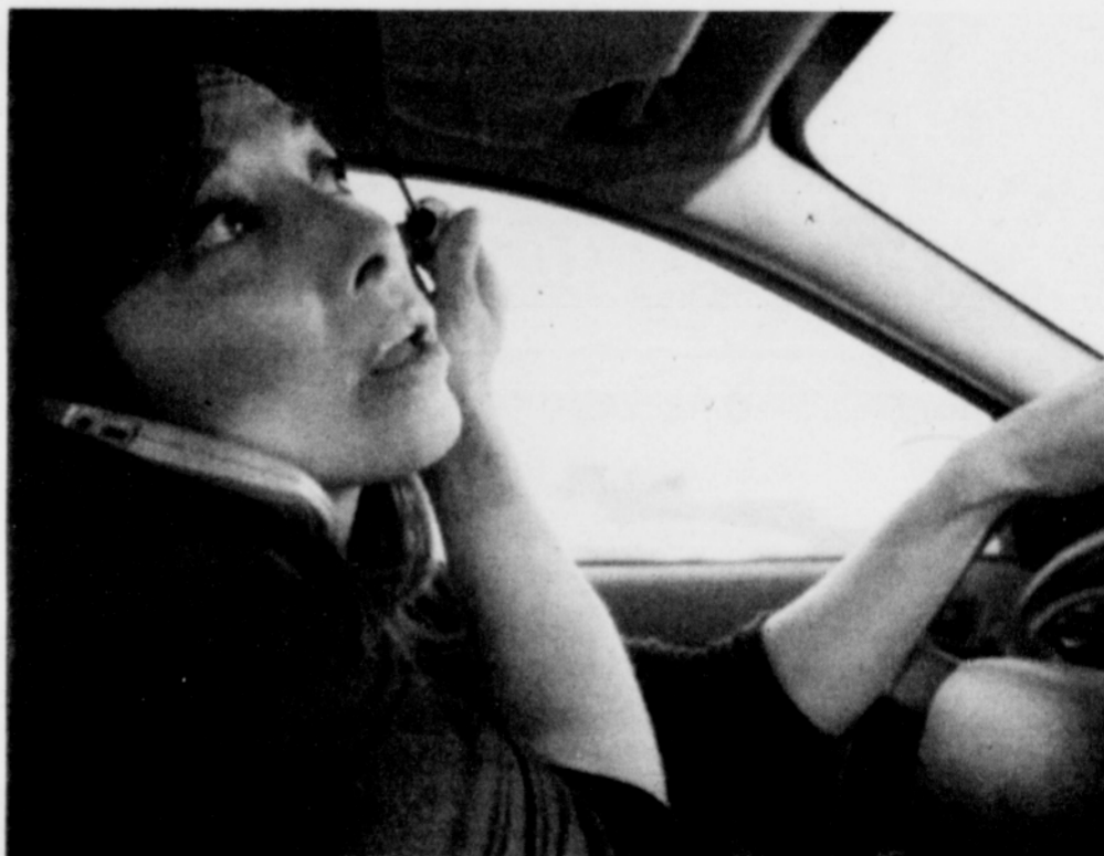
Distracted Driving has become a major concern on our roads.