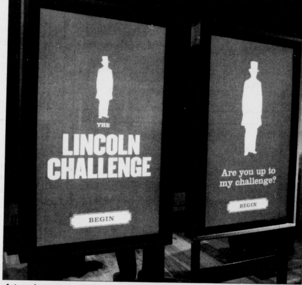
A touch-screen video game at the Oregon History Museum's new exhibit on the legacy of Abraham Lincoln allows visitors to test their knowledge of the 16th president and the Civil War.

In addition, the exhibit includes numerous Civil War-era costumes