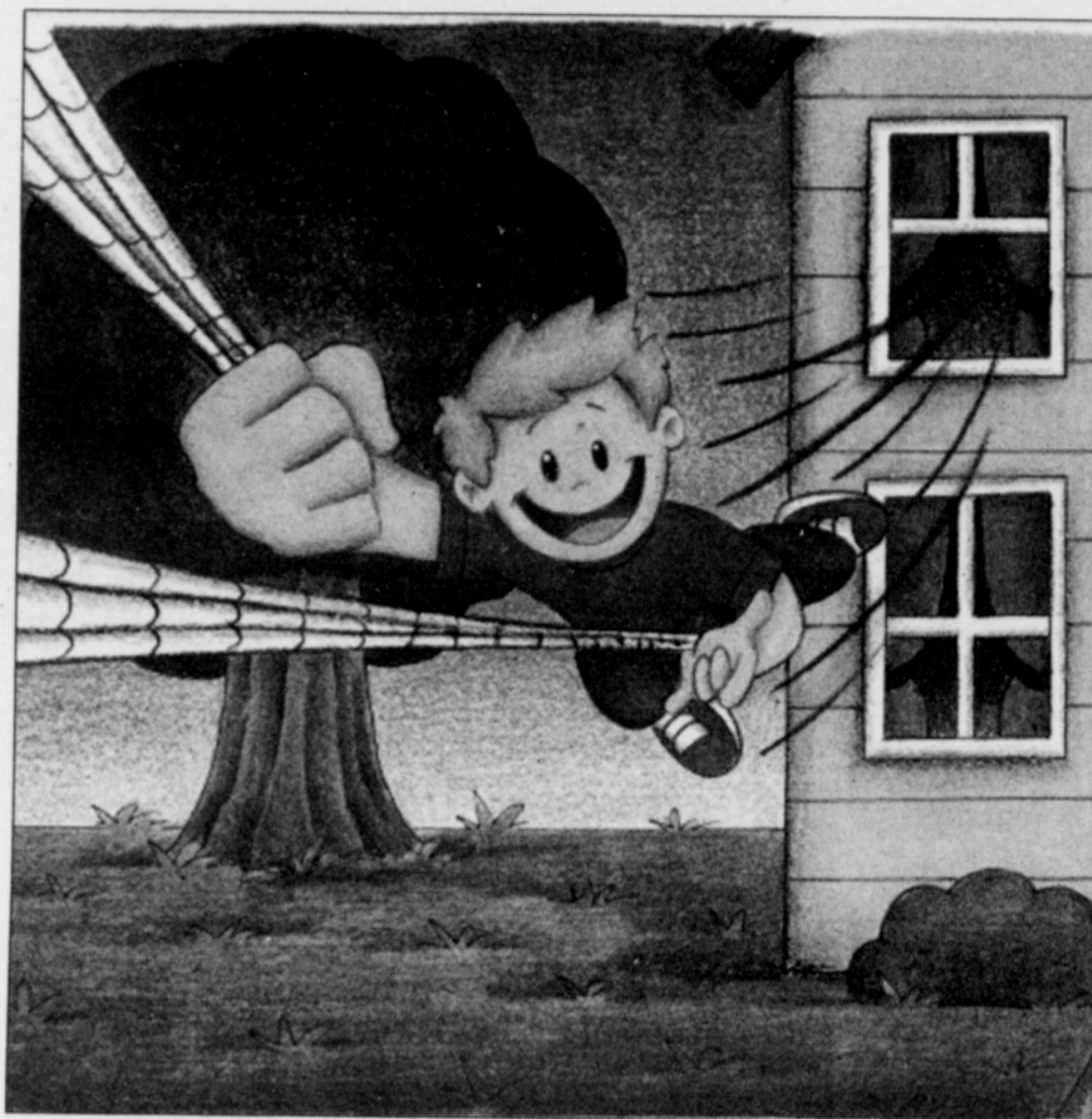
'Spider Kid' is a character from a Portland mom's new book designed to engage children and their families about the importance of staying safe around windows.