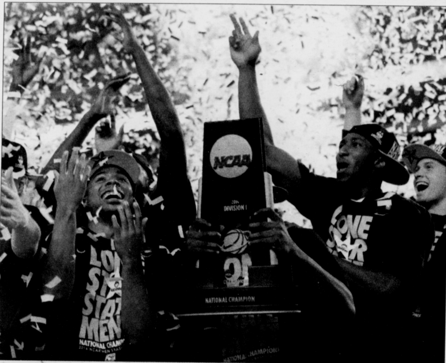
Connecticut celebrates with the championship trophy after beating Kentucky 60-54 at the NCAA Final Four tournament college basketball championship game Monday, April 7, 2014, in Arlington, Texas.