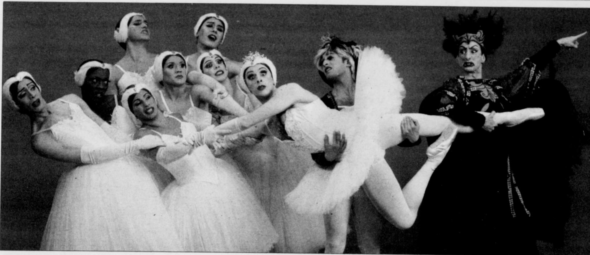
The all-male ballet company Les Ballets Trockadero de Monte Carlo returns to Portland for a performance at the Arlene Schnitzer Concert Hall on Wednesday, April 2 at 7:30 p.m.