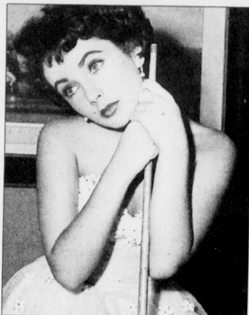
Elizabeth Taylor in the Academy Award-winning classic, A Place in the Sun. A special screening of the movie will take place Sunday at 7 p.m. at the Hollywood Theater in northeast Portland in a benefit for HIV and AIDS charities.

The event and screening is open to the public, with a donation of $15 or more to be made at the door. All