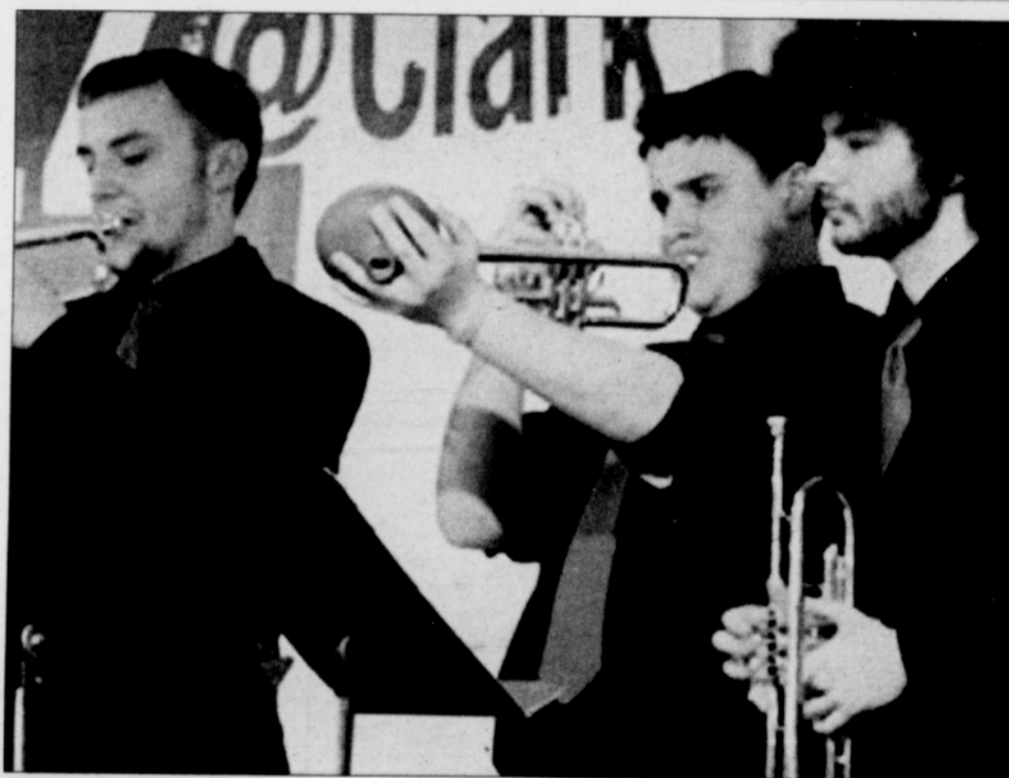
High school musicians perform at the annual Clark College Jazz Festival.

Bronson's father is an Albanian immigrant and his mother is a Jewish New Yorker. Before entering the rap scene, he was a respected fire-flame gourmet chef in New York City. He frequently raps about food in his songs and hosted his own online cooking show entitled "Action in the Kitchen."