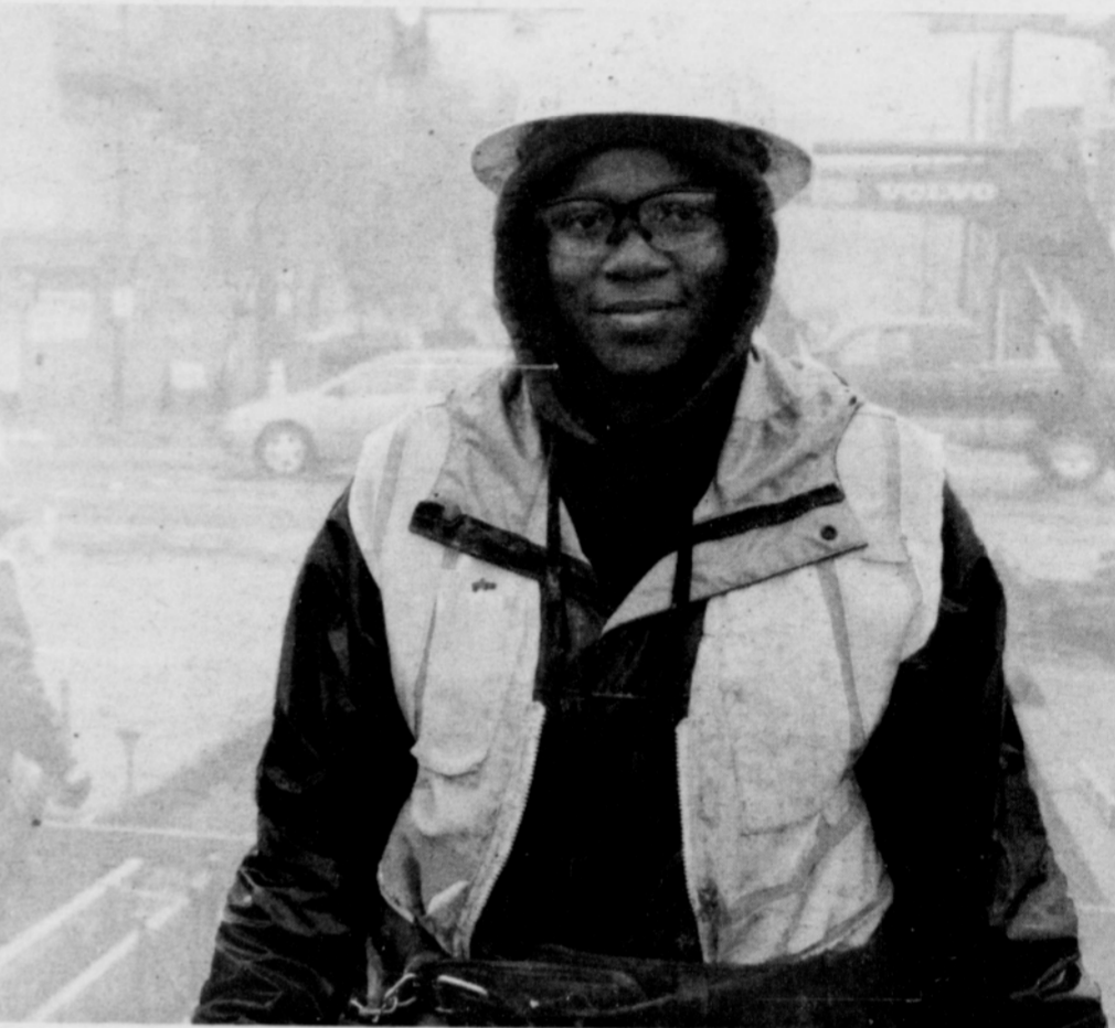
My Walk Has Never Been Average , a multimedia presentation based on the oppressions black working class women face, will take place Saturday, Feb. 1 at 7:30 p.m. at Portland Playhouse, 602 N.E. Prescott St. The event is co-hosted by the local theater group and the August Wilson Red Door Project as part of Portland's Fertile Ground Festival.

The August Wilson Red Door Project will host a talk back following the performance. The performance is sponsored by Oregon Tradeswomen, Inc.