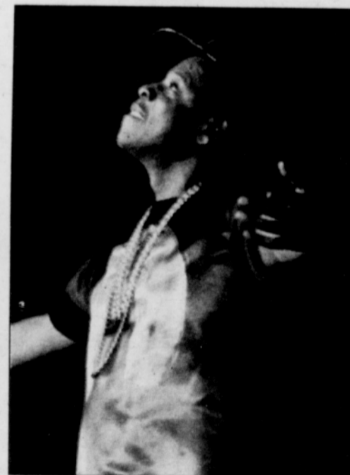
Jay-Z performs at the "Made In America" music festival in Philadelphia. Jay Z will perform at DirecTV's Super Bowl Eve party in New York.

NEW YORK (AP) - The Super Bowl practically comes with a guarantee of A-list star wattage: No matter where it's held, celebrities