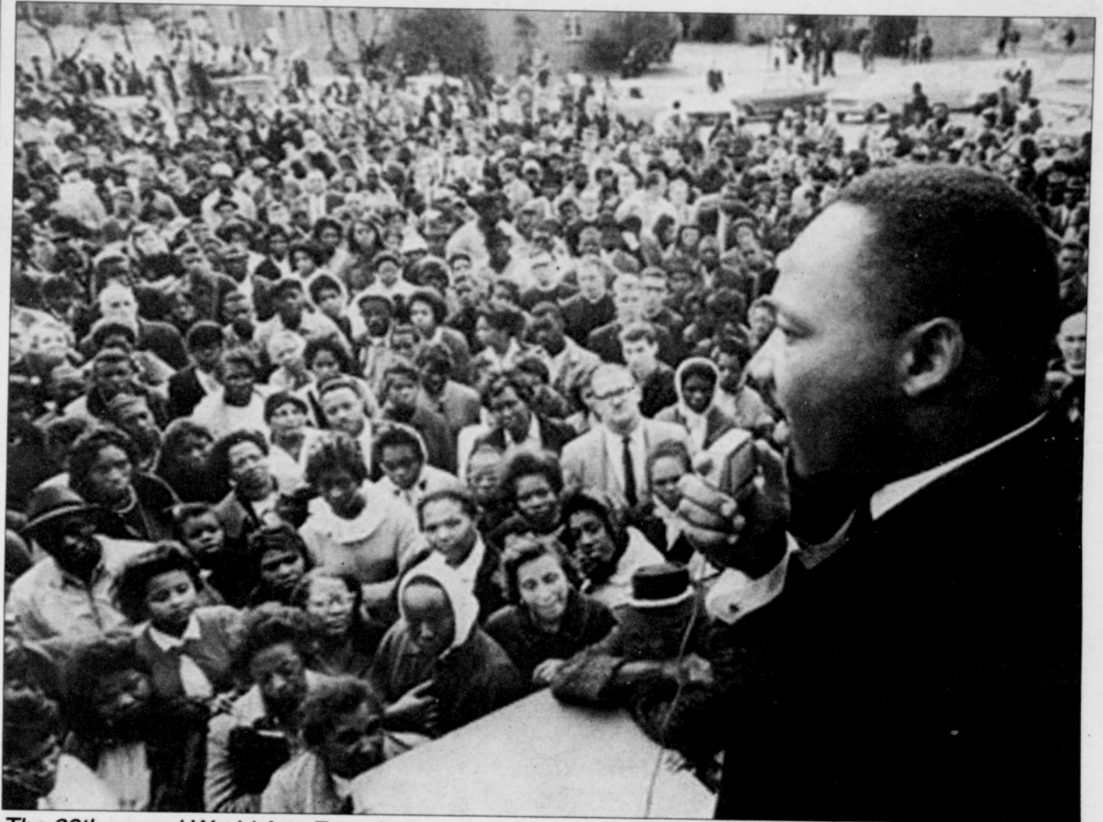
The 29th annual World Arts Foundation tribute to the life and legacy of Rev. Dr. Martin Luther King Jr. and also commemorating the 50th Anniversary of the 1963 March on Washington, will be held Monday, Jan. 20 at the Anthem Conference Center, located at Northeast 172nd and Sandy Boulevard.