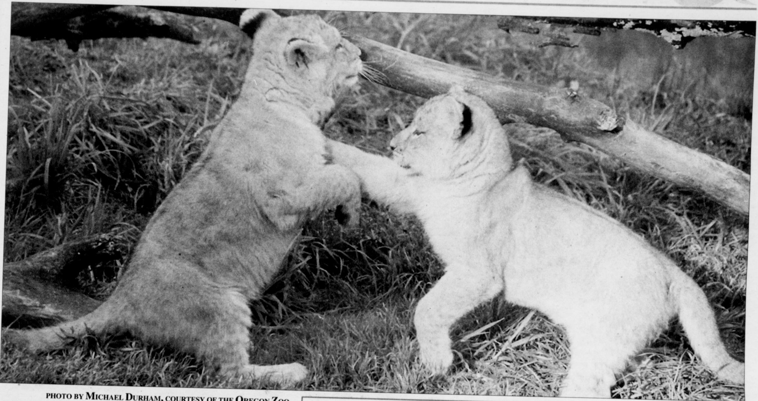
Two of the Oregon Zoo's lion cubs play in the Predators of the Serengeti habitat.