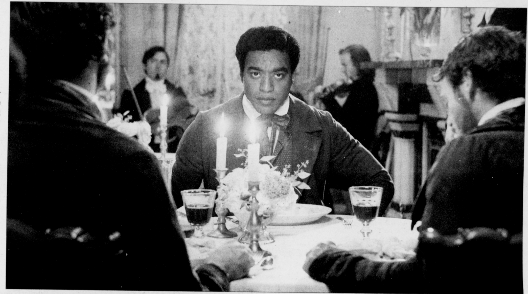
12 Years a Slave is based on the 1853 autobiography of Solomon Northup (played by Chiwetel Ejiofor), a free black man who was later sold into slavery in the South.

Outstanding comedy series actor nominees are Andre Braugher for "Brooklyn Nine-Nine," Cedric The Entertainer for "The Soul Man,"