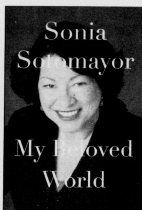
Everybody Reads 2014 featuring the book My Beloved World by U.S. Supreme Court Justice Sonia Sotomayor is underway at the Multnomah County Library