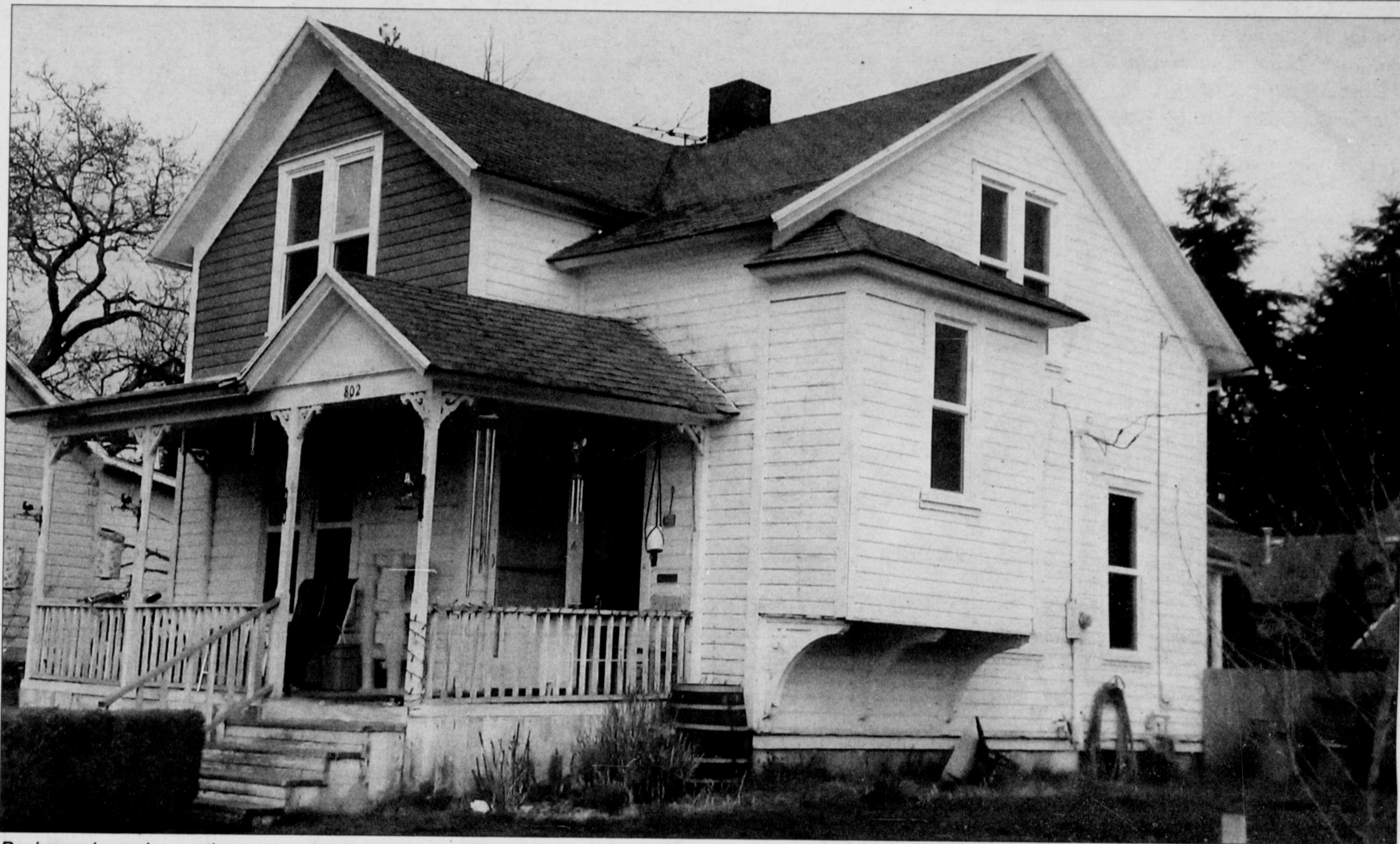
Basic repairs and upgrades are needed for many older homes. The city of Vancouver is offering low interest loans to help with the cost of repairs for qualified low-income homeowners.