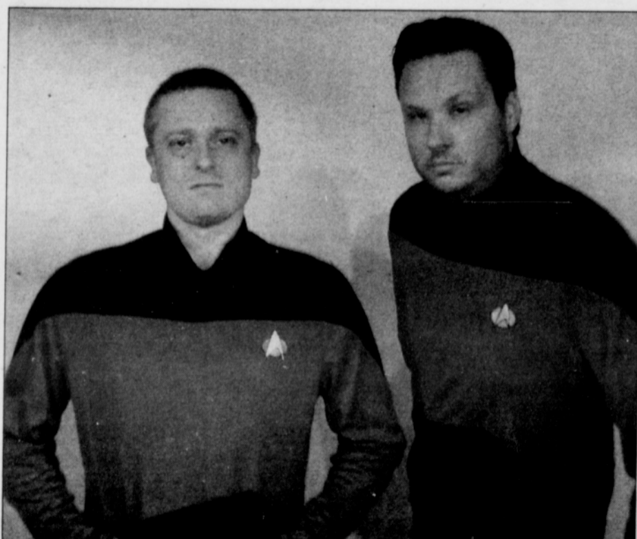
Portland's Unscriptables theater group opens the New Year with one of its favorite spoofs.