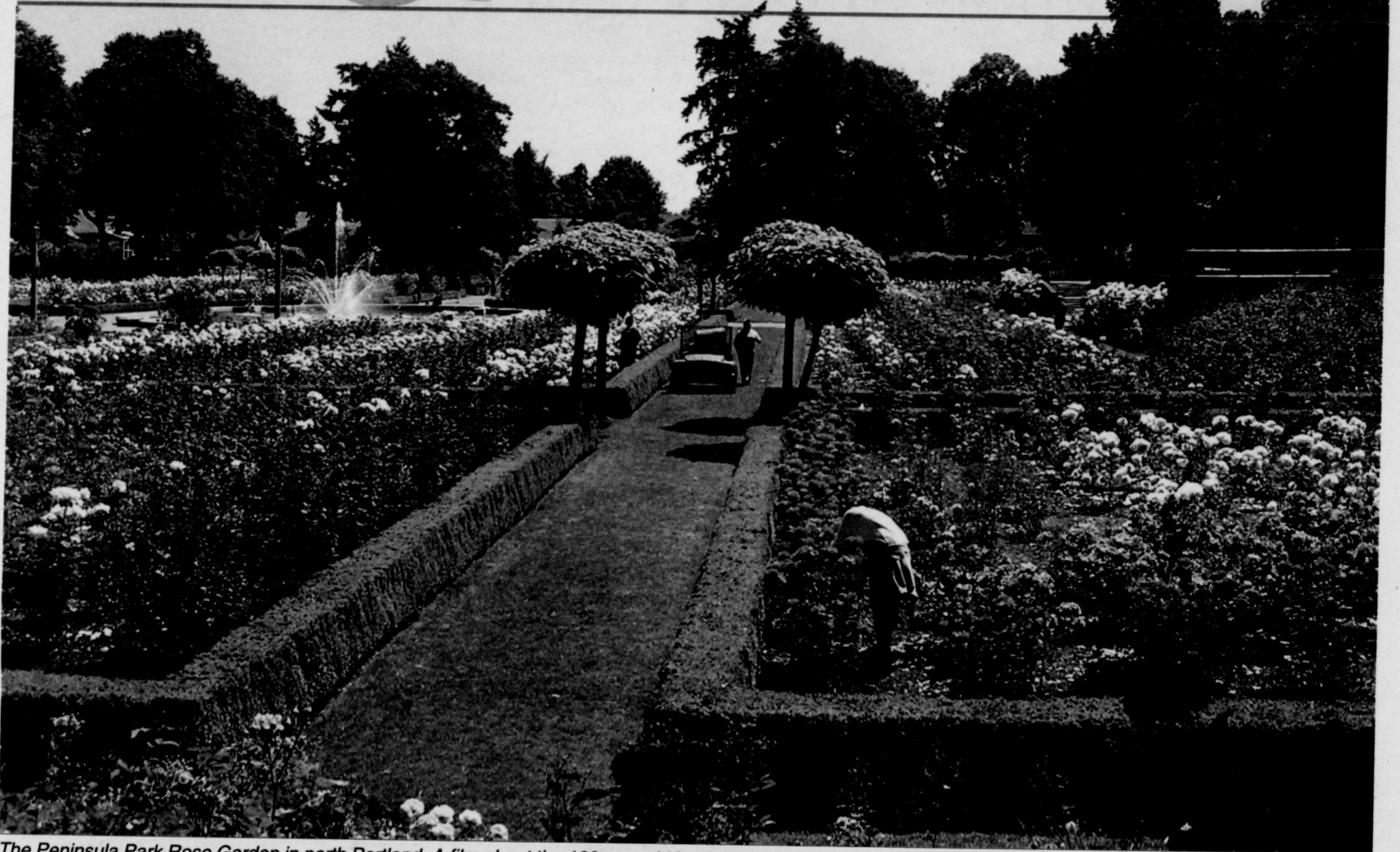
The Peninsula Park Rose Garden in north Portland. A film about the 100 year old landmark created by local teens will be present free on Sunday, Dec. 29 at 2 p.m. at the Hollywood Theater.