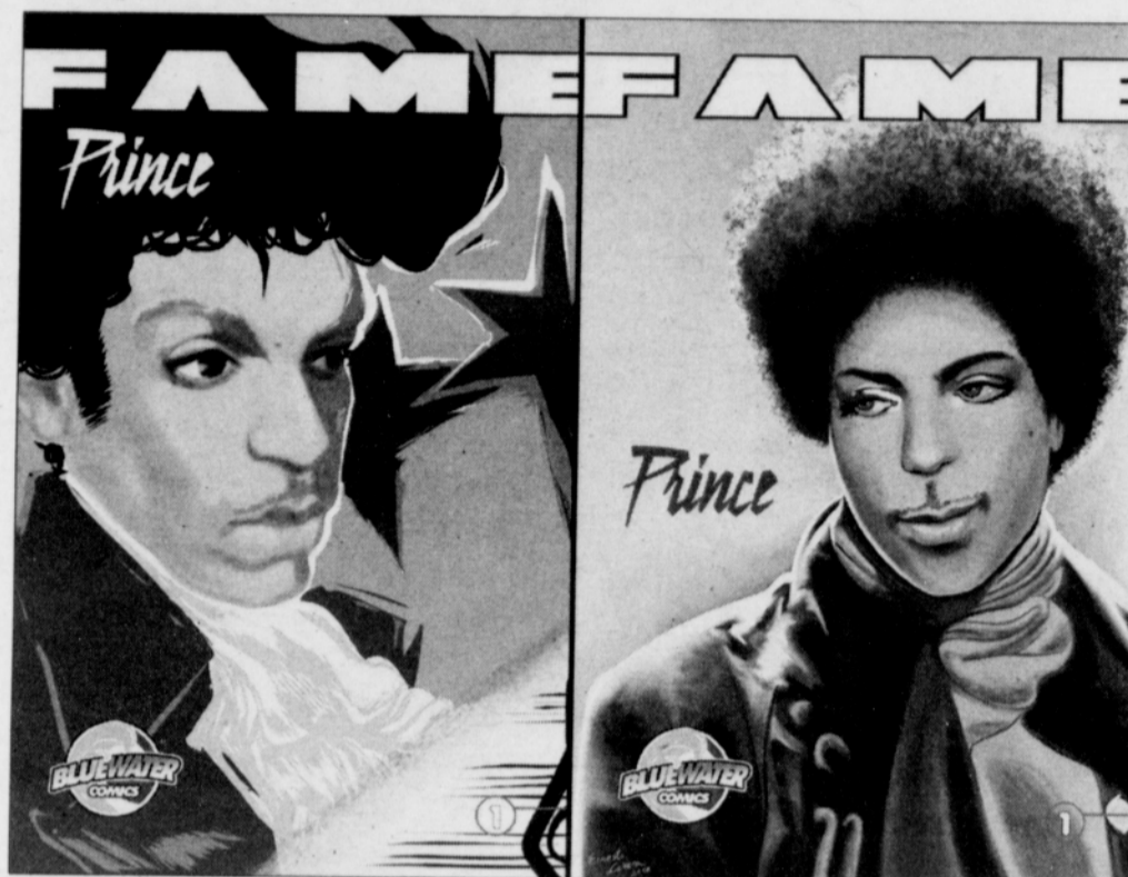
Fame: Prince is a new comic book about the life of the music icon Prince available in print and digital.