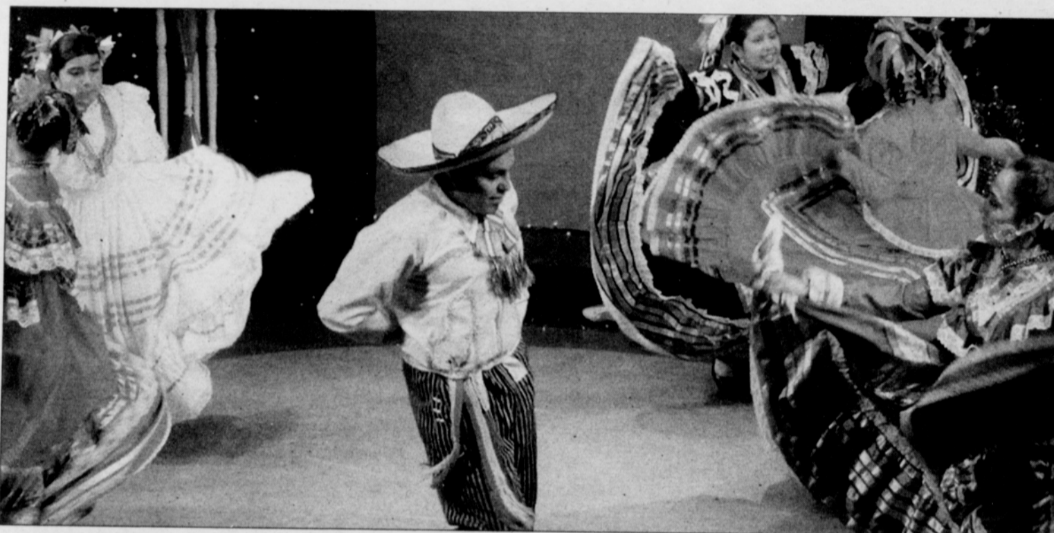
Posada Milagro, a free Christmas celebration with theatre, music, dance, and traditional foods for the whole family takes place Sunday, Dec. 15, from 1 p.m. to 5 p.m. at El Zócalo of El Centro Milagro, 537 S.E. Stark St.

For more information about Miracle Theatre Group, visit milagro.org or call 503-236-7253.