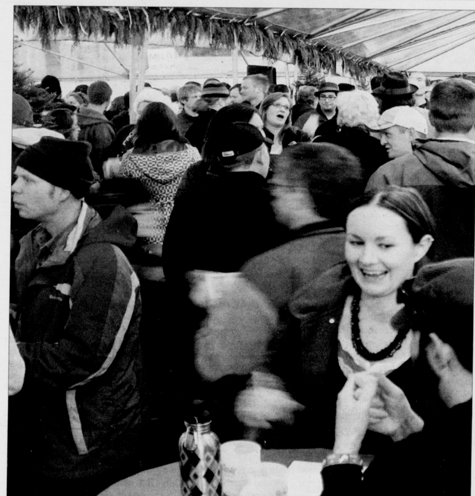
One of Portland's most popular winter events, the Holiday Ale Festival takes place at Pioneer Courthouse Square, starting Wednesday, Dec. 4 and continuing through Sunday, Dec. 8