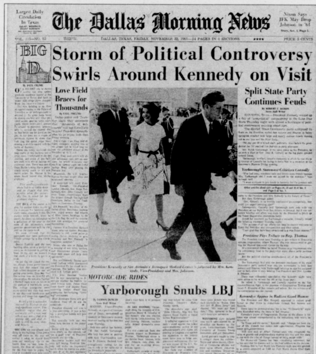
A newspaper from the morning John F. Kennedy was killed in Dallas is believed to be the last thing he signed before he was assassinated. The artifact is part of an exhibit "The Fading Light of Camelot" at the Oregon Historical Society.

The exhibit also includes a letter about the death of his son Patrick, who died at birth on Aug. 9, 1963; a condolence letter Kennedy wrote to the widow of assassinated Civil Rights activist Medgar Evers; a rare