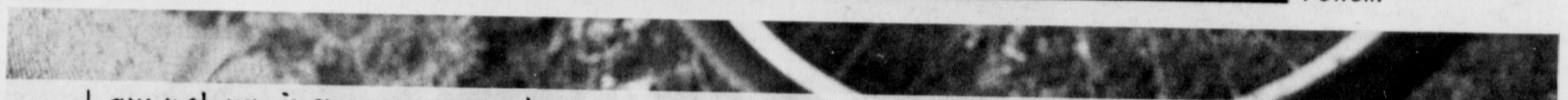
I am not my insurance card