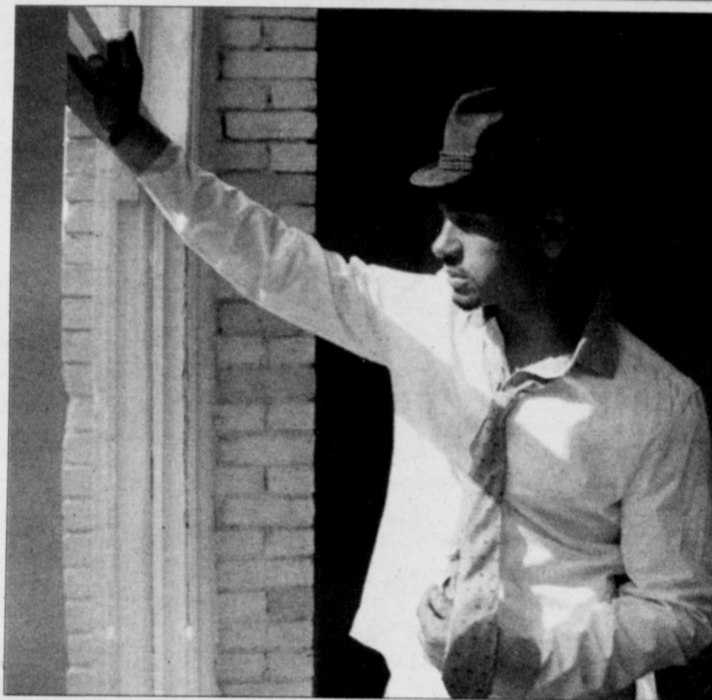
Jonathan Arthur 'Chico' DeBarge

DeBarge returned to Motown to continue his musical career.